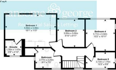
First Floor Approx 60 sq m / 644 sq ft